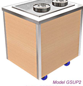
Option GBEECCHA2 Shown