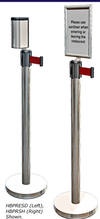
HBPRESD (Left), HBPRSH (Right) Shown.