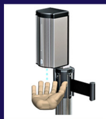
Electronic Sanitiser: Push Fit Connection On Post Top.

Health & Safety. Barrier posts provide an ideal solution for risk assessments, undertaken by businesses in compliance with the FDA June 2020 UK Government Guidance 'Keeping workers and customers safe during COVID-19 in restaurants, pubs, bars and takeaway services'.