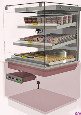
900mm Self Help Hot Patisserie (Fixed Back) Shown