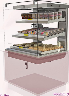
900mm Self Help Hot Patisserie (Rear Doors) Shown