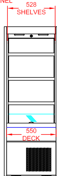
FRONT VIEW (CUSTOMER SIDE)

LOCKABLE CASTORS WITH ADJUSTABLE CENTRE FOOT (SPANNER SUPPLIED)