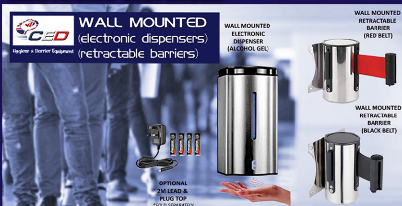
Wall Mounted Electronic Sanitiser Dispenser (Alcohol Gel \geq 60\% ).

CED's electronic sanitising dispenser is hands free to help maintain a hygienic environment, combining safety and practicality at low cost. Public Health England advise that using a sanitising gel with an alcohol content of 60% and above, is effective at killing corona virus. This dispenser can be placed in several locations to encourage PPB (personal protective behaviour).