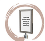
Sign Holders Post Mounted