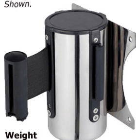
HWMPB: Wall Mounted Barrier (Black Belt) Shown.