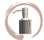
Sanitisers Pump Dispensers