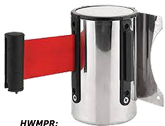
HWMPR: Wall Mounted Barrier (Red Belt) Shown.