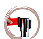
Barrier Posts Red + Black Tape