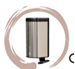
Sanitisers Hands Free