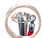
Guide Posts Ropes/ Hooks