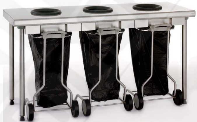
reference 507 532