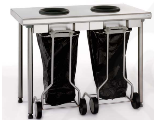
reference 507 531