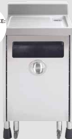
Drainer Top Bridge Unit (With Roll Under Bin)