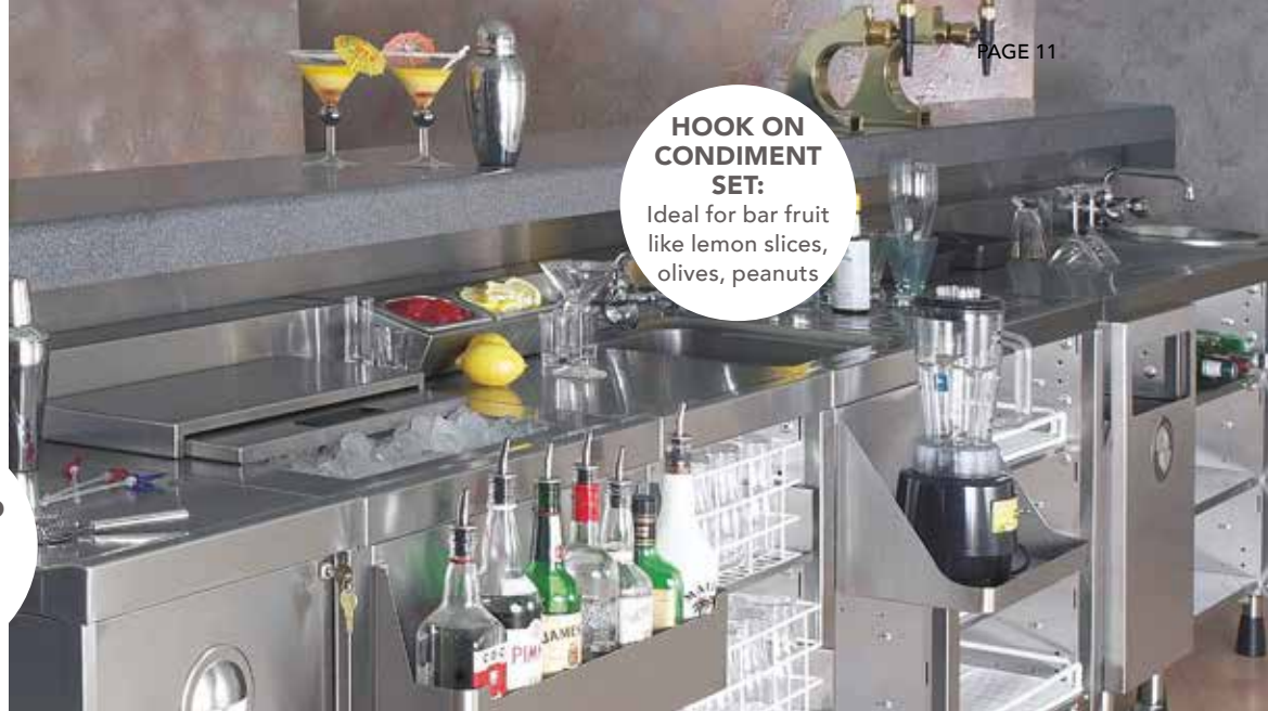
HOOK ON CONDIMENT SET: Ideal for bar fruit like lemon slices, olives, peanuts