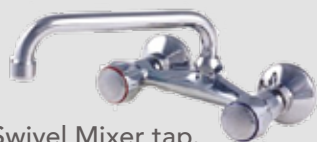
Swivel Mixer tap.

BETTER BY DESIGN: Ideal for cocktail drinks preparation