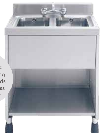
Double Sink Unit

FASTER SERVING: Glass washing station speeds up clean glass availability