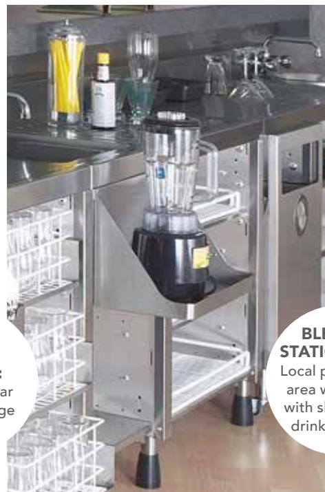
BLENDER STATION UNIT: Local preparation area wash point with shelving for drinks blender