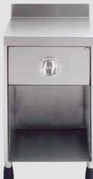
Single Drawer Unit