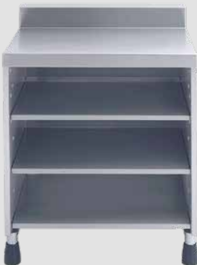
Plain Top Shelving Unit (Steel Shelf Type)