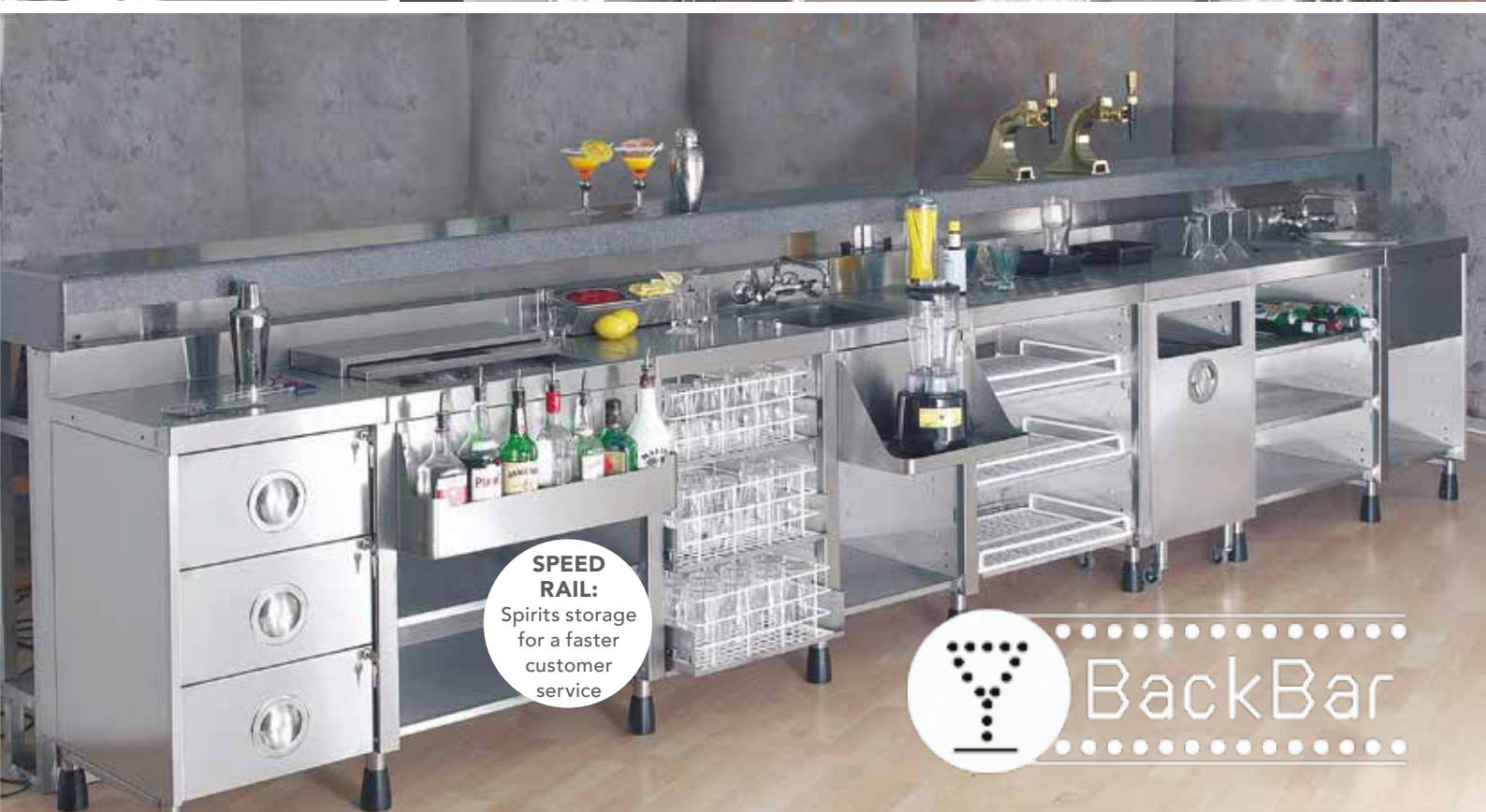
SPEED RAIL: Spirits storage for a faster customer service