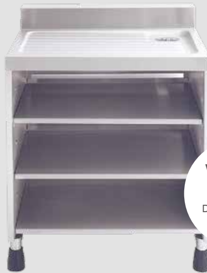
Drainer Top Shelving Unit (Steel Shelf Type)