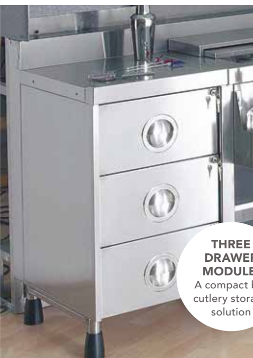
THREE DRAWER MODULE: A compact bar cutlery storage solution