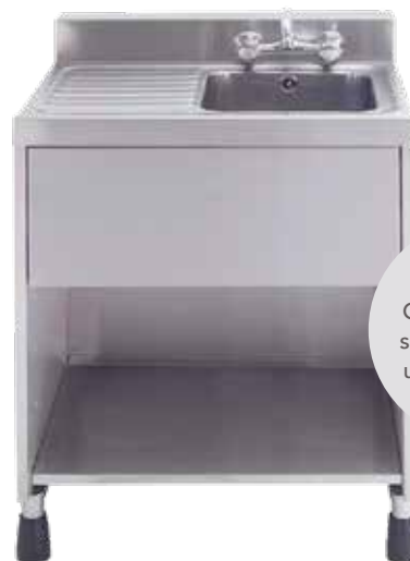
Single Sink Unit