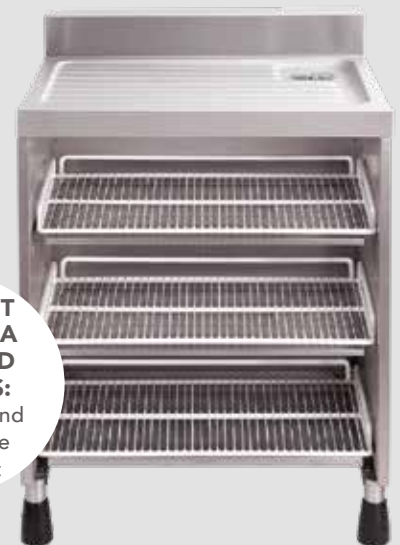
Drainer Top Shelving Unit (Rack Shelf Type)

COMPACT WET AREA FOR USED GLASSES: Drain, dry and store in the same unit