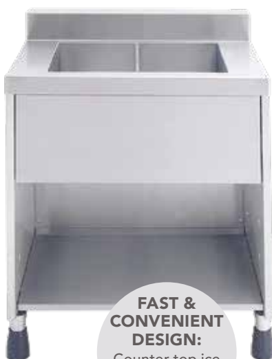
Ice Chest (Open Type)

FAST & CONVENIENT DESIGN: Counter top ice station reduces serving times