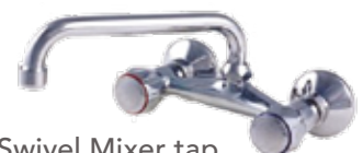
Swivel Mixer tap. Stock No - 851

FASTER SERVING: Glass washing station speeds up clean glass availability