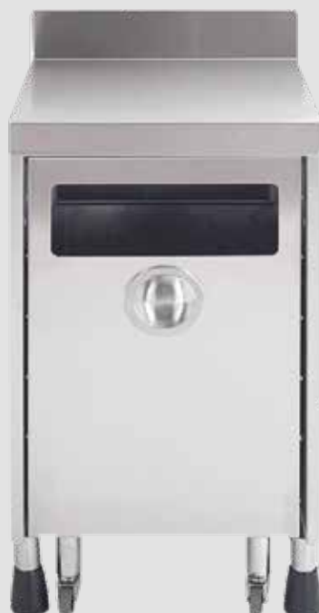
Plain Top Bridge (With Roll Under Bin)