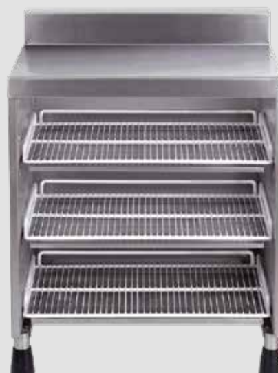
Plain Top Shelving Unit (Rack Shelf Type)