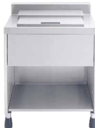
Ice Chest (With Lid)

FAST & CONVENIENT DESIGN: Counter top ice station reduces serving times