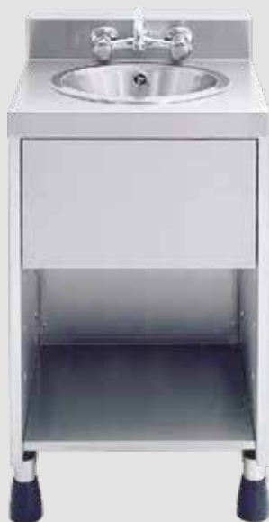
Wash Hand Basin Unit