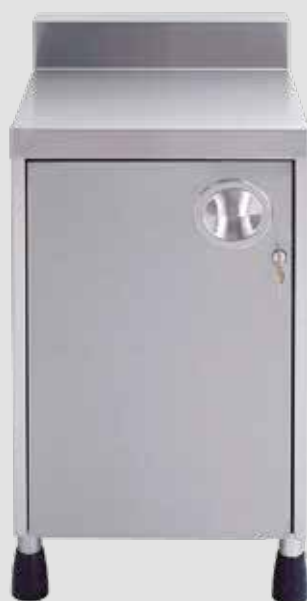
Storage Cupboard Unit