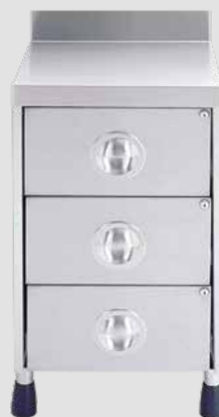
Three Drawer Unit