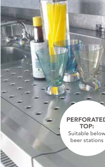
PERFORATED TOP: Suitable below beer stations