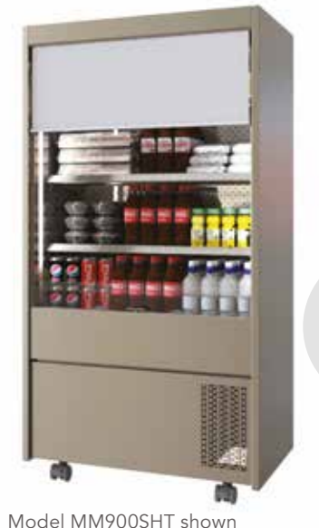
HIGH SECURITY: Twin locking shutter system