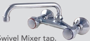
Swivel Mixer tap.

BETTER BY DESIGN: Ideal for cocktail drinks preparation