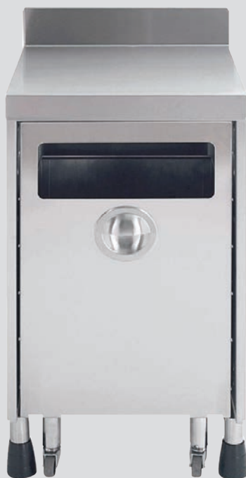
Plain Top Bridge (With Roll Under Bin)