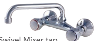
Swivel Mixer tap. Stock No - 851