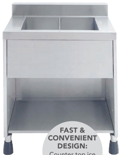
Ice Chest (Open Type)

FAST & CONVENIENT DESIGN: Counter top ice station reduces serving times