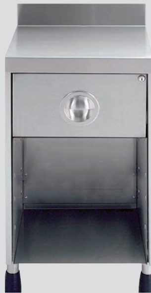
Single Drawer Unit