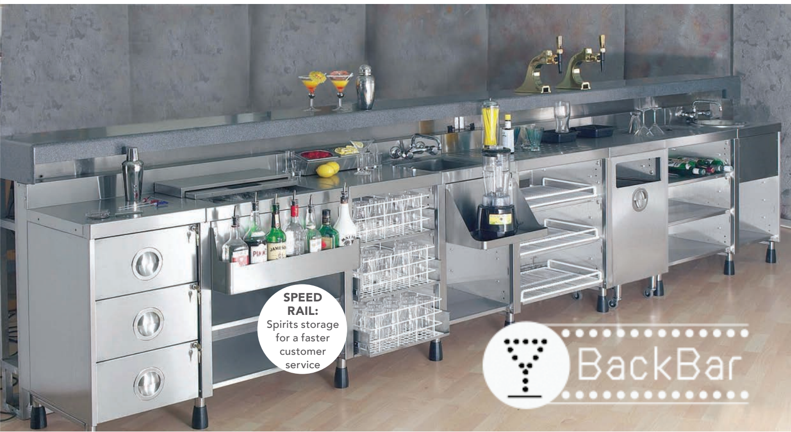
SPEED RAIL: Spirits storage for a faster customer service