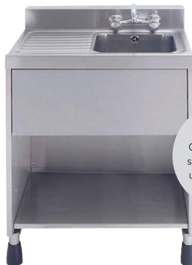
Single Sink Unit