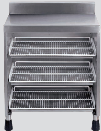
Plain Top Shelving Unit (Rack Shelf Type)