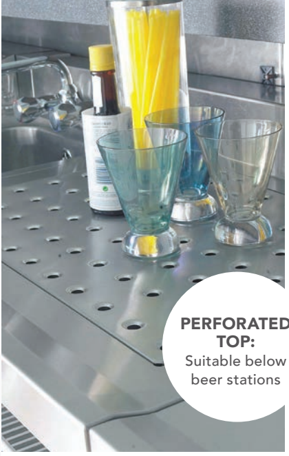
PERFORATED TOP: Suitable below beer stations