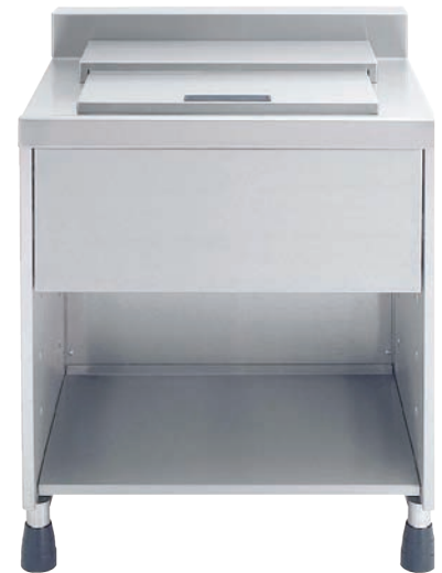
Ice Chest (With Lid)

FAST & CONVENIENT DESIGN: Counter top ice station reduces serving times