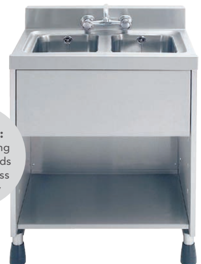
Double Sink Unit

FASTER SERVING: Glass washing station speeds up clean glass availability