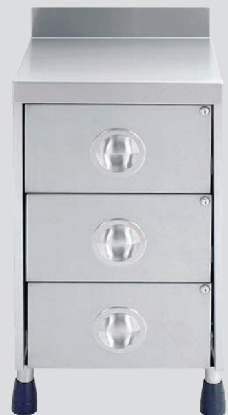
Three Drawer Unit