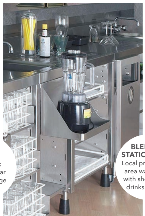
BLENDER STATION UNIT: Local preparation area wash point with shelving for drinks blender