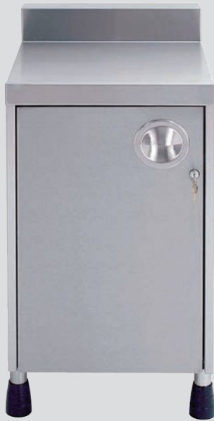
Storage Cupboard Unit