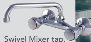
Swivel Mixer tap.