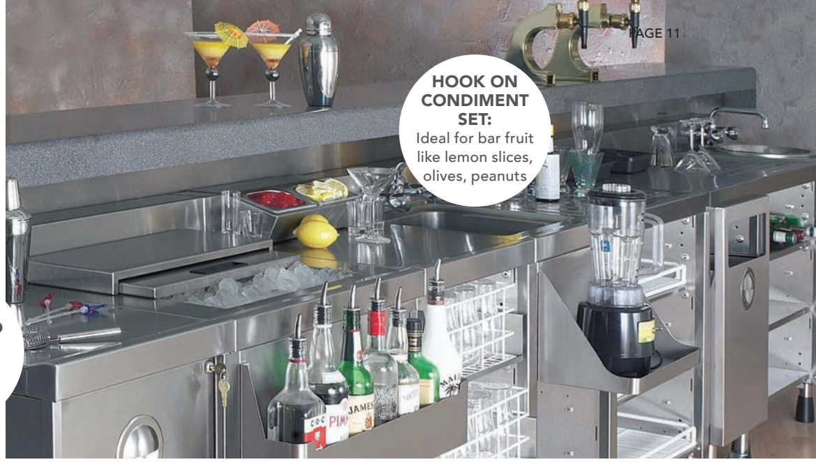
HOOK ON CONDIMENT SET: Ideal for bar fruit like lemon slices, olives, peanuts