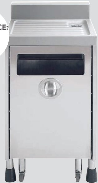
Drainer Top Bridge Unit (With Roll Under Bin)