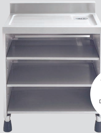
Drainer Top Shelving Unit (Steel Shelf Type)