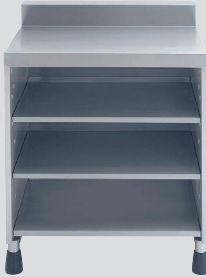
Plain Top Shelving Unit (Steel Shelf Type)