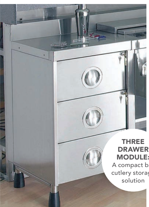
THREE DRAWER MODULE: A compact bar cutlery storage solution