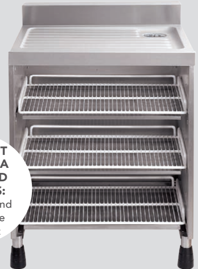
Drainer Top Shelving Unit (Rack Shelf Type)

COMPACT WET AREA FOR USED GLASSES: Drain, dry and store in the same unit