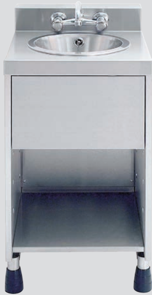
Wash Hand Basin Unit